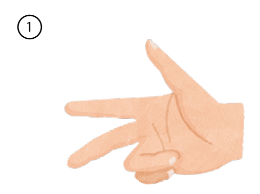
Two fingers tight shut and three opened out.